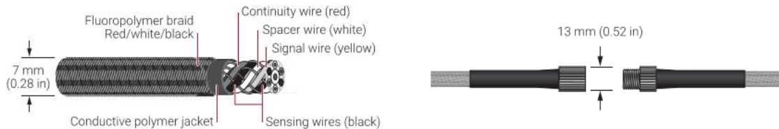
Drawing not to scale

Diamond Controls Ltd. Unit 5, Baines Way, Norwich, Norfolk, NR5 9JR